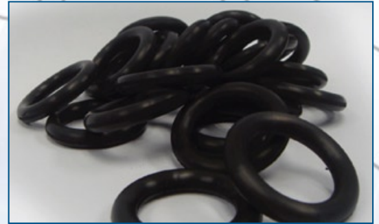
DynaRING™ is available in oil and water swellable compounds, and can be purchased from stock or designed to client requirements