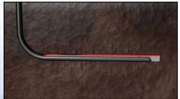
Cement Zonal Isolation